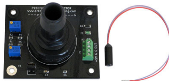
Universal SOS Detection Kit

Precision Laser Scanning, LLC 25750 North 82nd Street Scottsdale, Arizona 85255 USA TEL 1-480-515-1643 info@precisionlaserscanning.com www.precisionlaserscanning.com